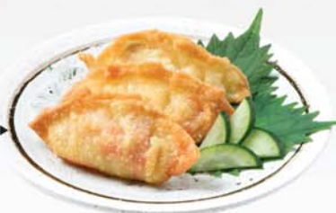
Shrimp Gyoza ▶