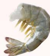
▲ Headless Shell-On