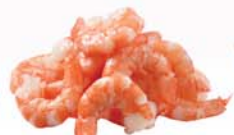
▲ Cooked Peeled Undeveined Tail-Off