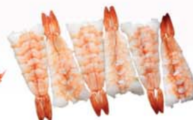
▲ Sushi Ebi