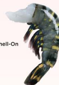
► Headless Shell-On