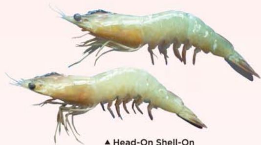
▲ Head-On Shell-On