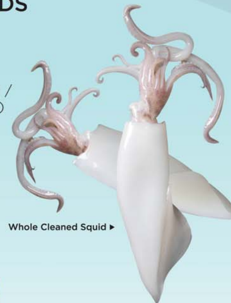
Whole Cleaned Squid ▶