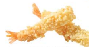
▲ Tempura Shrimp