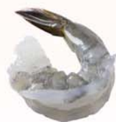
▲ Peeled Deveined Tail-On