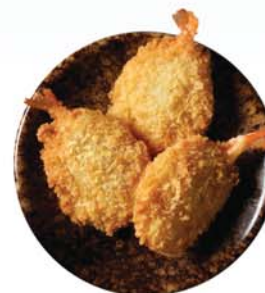
▲ Breaded Butterfly Shrimp