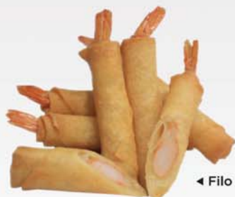
◀ Filo Shrimp