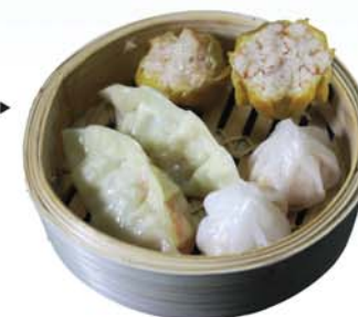
Dumpling Mix ▶