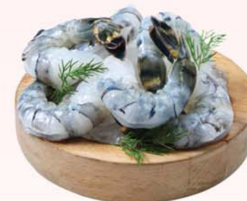
▲ Peeled Deveined Tail-On