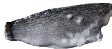
▼ Fish Fillet