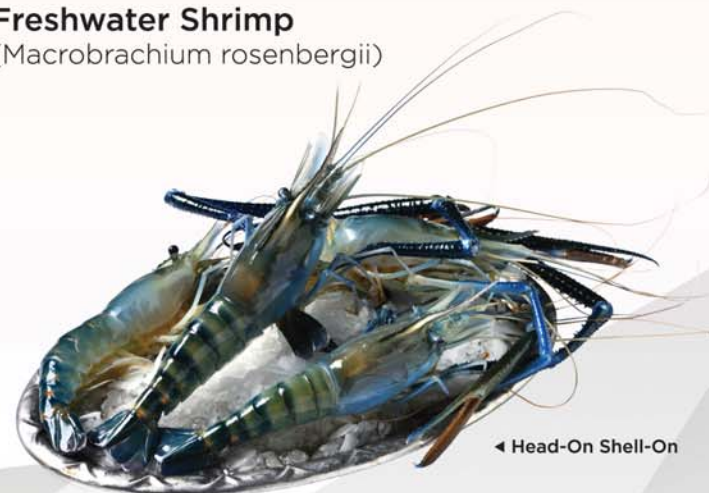
◀ Head-On Shell-On