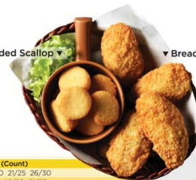
▼ Breaded Fish Fillet