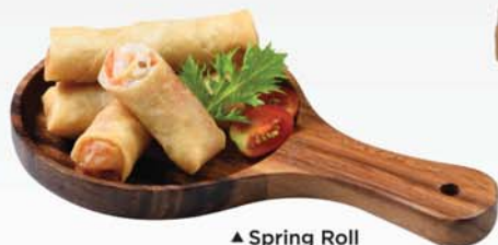
▲ Spring Roll