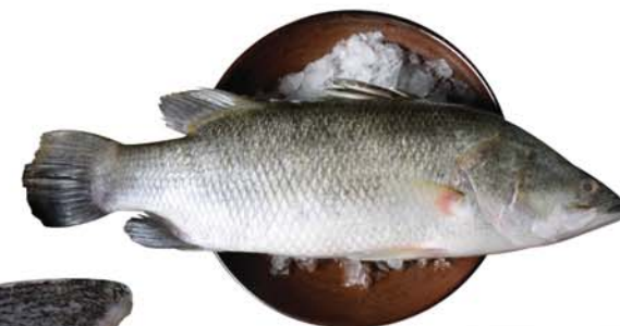
▲ Whole Gutted, Gilled and Scaled Seabass Fish (WGGS)