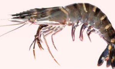
▲ Head-On Shell-On