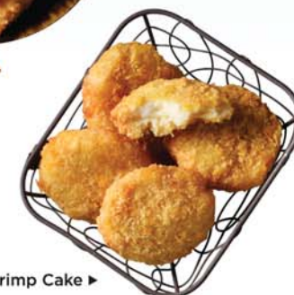
Breaded Shrimp Cake ▶