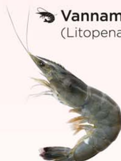
▲ Head-On Shell-On