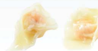
▲ Shrimp Wonton