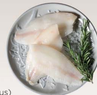
◀ Fish Fillet