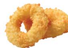
▲ Breaded Squid Rings