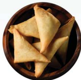
▲ Seafood Samosa