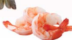
▲ Cooked Peeled Deveined Tail-On