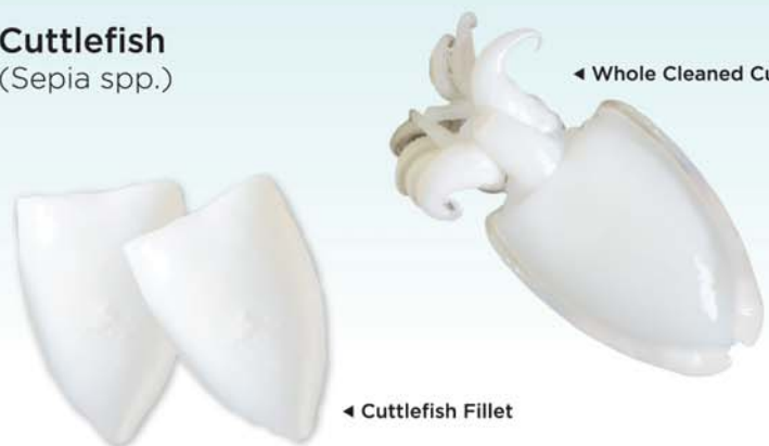
◀ Whole Cleaned Cuttlefish