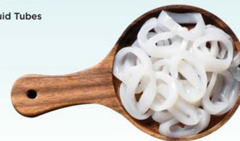
◀ Squid Rings