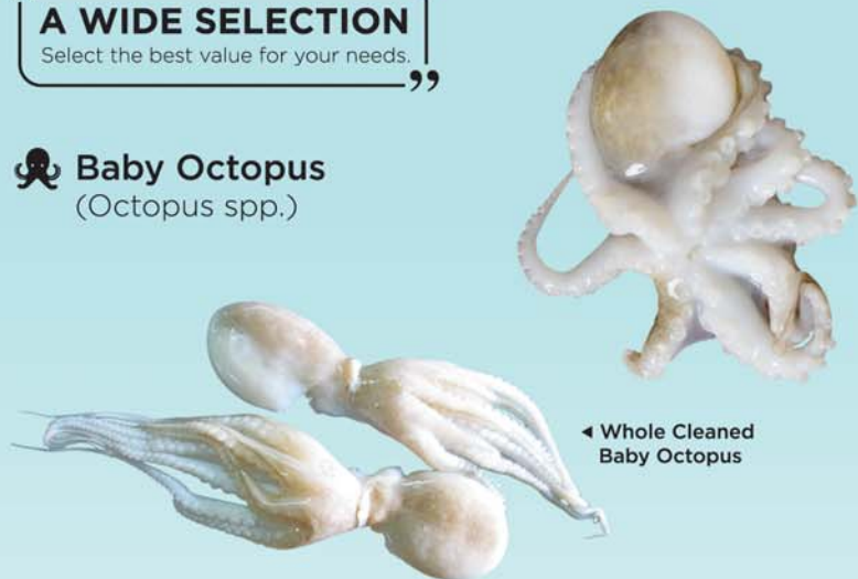
◀ Whole Cleaned Baby Octopus