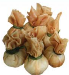
▲ Seafood Money Bag