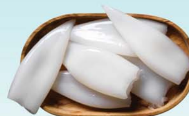
▲ Squid Tubes