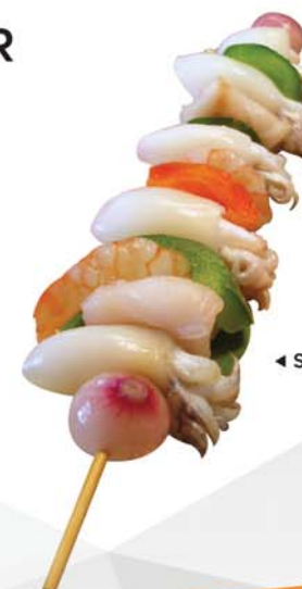
◀ Seafood Skewer / Shrimp Skewer