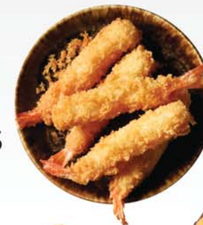
◀ Breaded Torpedo Shrimp