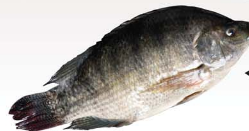
◀ Whole Gutted, Gilled and Scaled Tilapia Fish (WGGS)